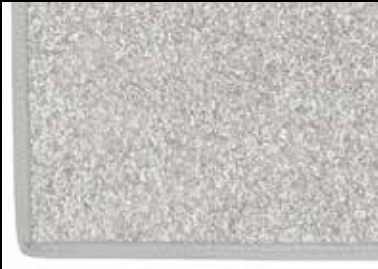
Standard: matching braid

Select your preferred border: either a Standard matching braid in the same colour as your rug, or if available for this reference, a more elaborate predefined Deluxe border.