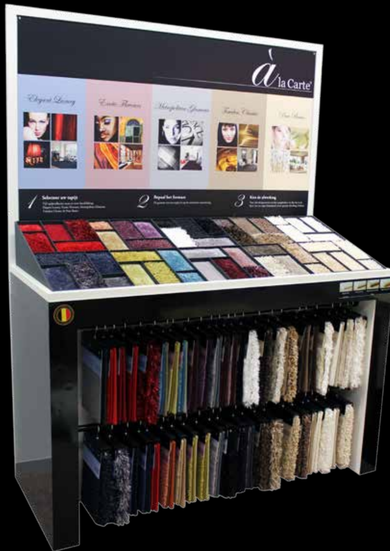
Wall Display - 158 cm x 65 cm x h 205 cm